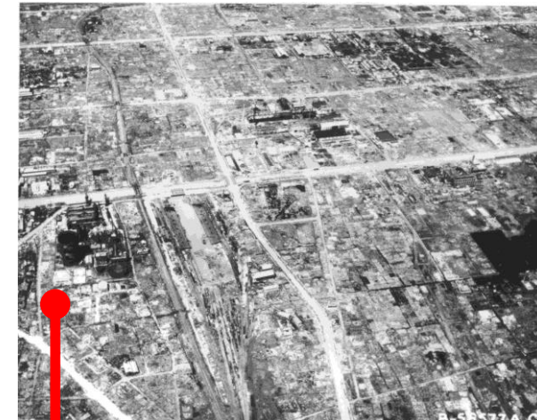
The Center of the Tokyo Raids and War Damages

Near Kitasuna and Ojima, Koto-ku, Tokyo, September 1945